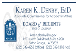
image001.png 47 KB